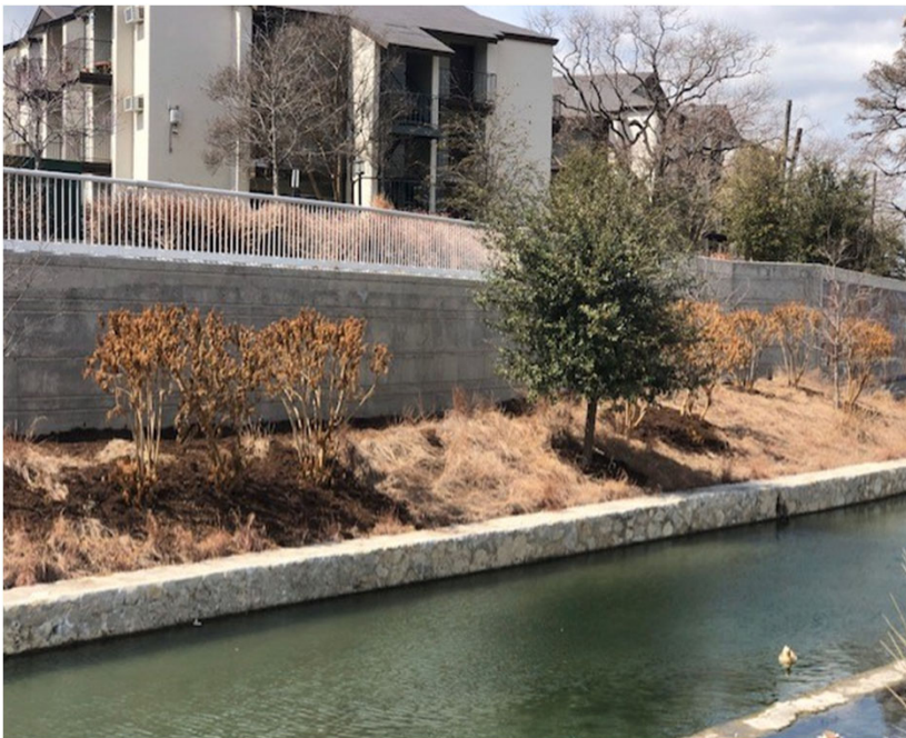
Esperanza and Little Bluestem