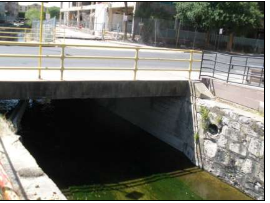
Multi-purpose bridge south of Commerce